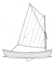
Beach Pea Pod